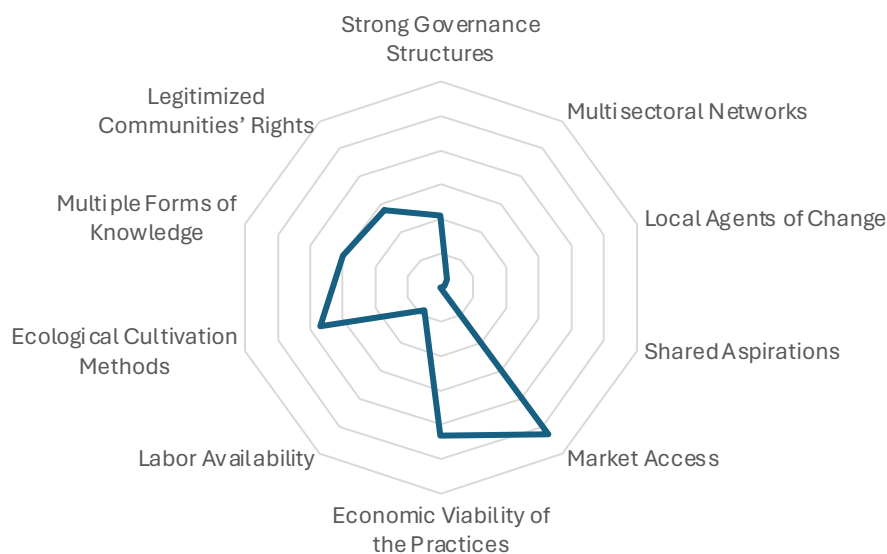
Figure 2. Prevalence of conditions for scaling up agroecology in Peruvian public policies

When it comes to how each of the proposed conditions appeared in the policy documents, “market access,” “economic viability of the practices,” and “ecological cultivation methods” were the most frequently identified. Figure 2 illustrates the predominance of these conditions based on the number of text segments coded for each condition across the policy documents.