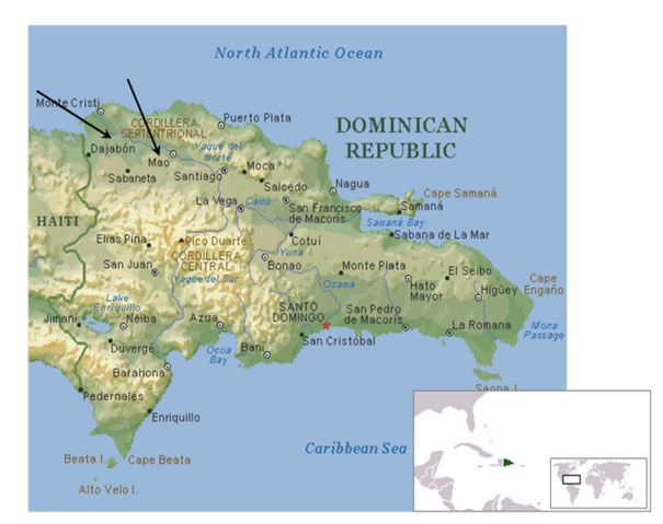
Figure 3. Map and study area.

As bananas cannot be grown in northern latitude nations, colonial holdings in the Caribbean have been important sources of bananas, particularly so for the British Isles. As such, post-colonial economic development schemes have focused on this historically important commodity for former colonies now struggling to establish 'independent' economies. For example, the Windward Islands and Jamaica had exclusive supply contracts to the UK through UK-based importers Geest and Fyffes, and thus dominated the supply of bananas to the UK until 1995. The loss of this due to American trade pressure, coupled with low economies of scale due to poor topography and soil quality, meant the small banana farms of the Caribbean islands, with